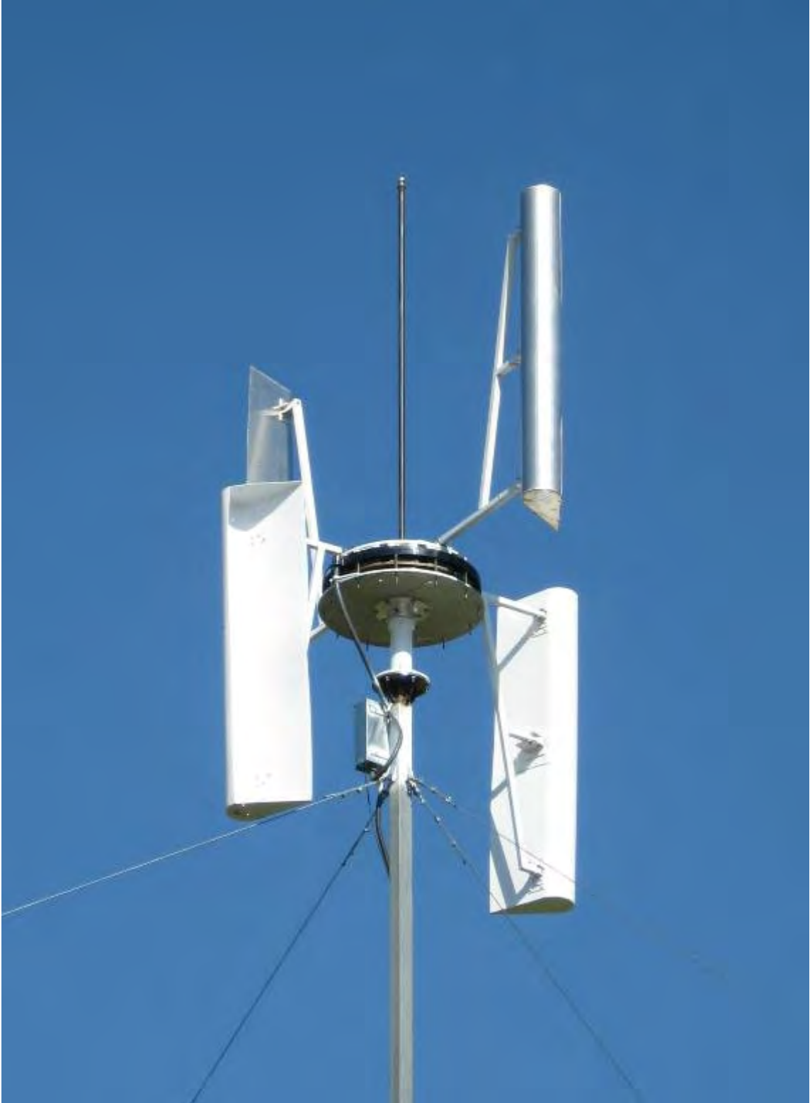
Actual Application with Lightning Rod.